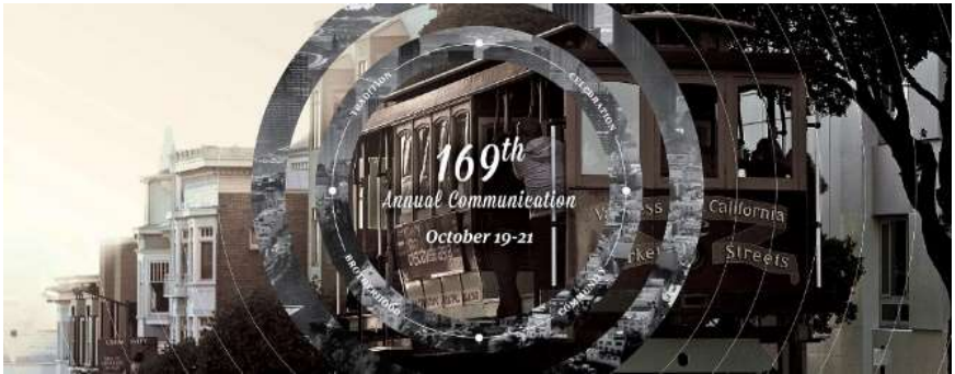
Grand Lodge of California 169 th Annual Communication. October 19-21